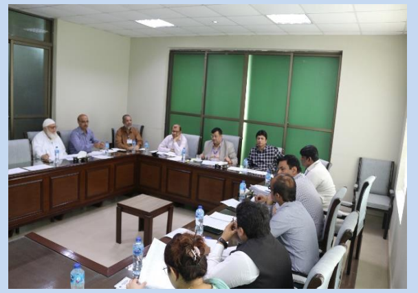
The ISAC Interviews for Flood Effected Scholarship under USAID Funded Merit and Need Based Scholarship Program held on Monday, 22<sup>nd</sup>May 2023.