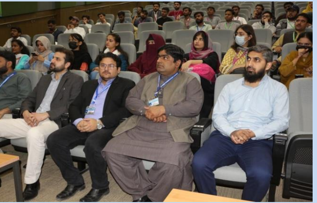
Outreach session for PHD scholarship under "US-Pakistan Knowledge Corridor" on December, 6<sup>th</sup> 2022 under Higher Education Commission.