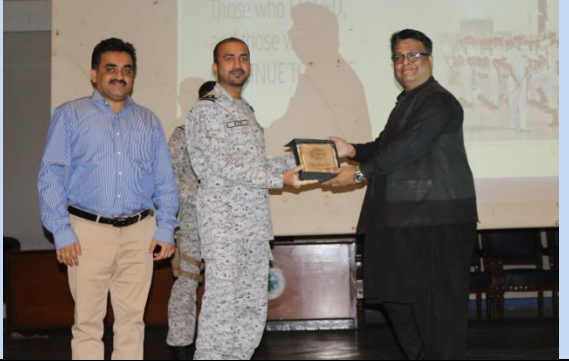
Pak Navy Recruitment drive