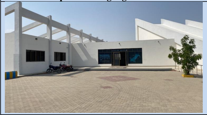
Science and Technology Park