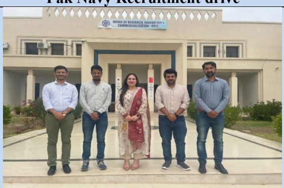
Pak Matiari transmission line Recruitment