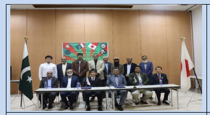
Japanese Language MOU